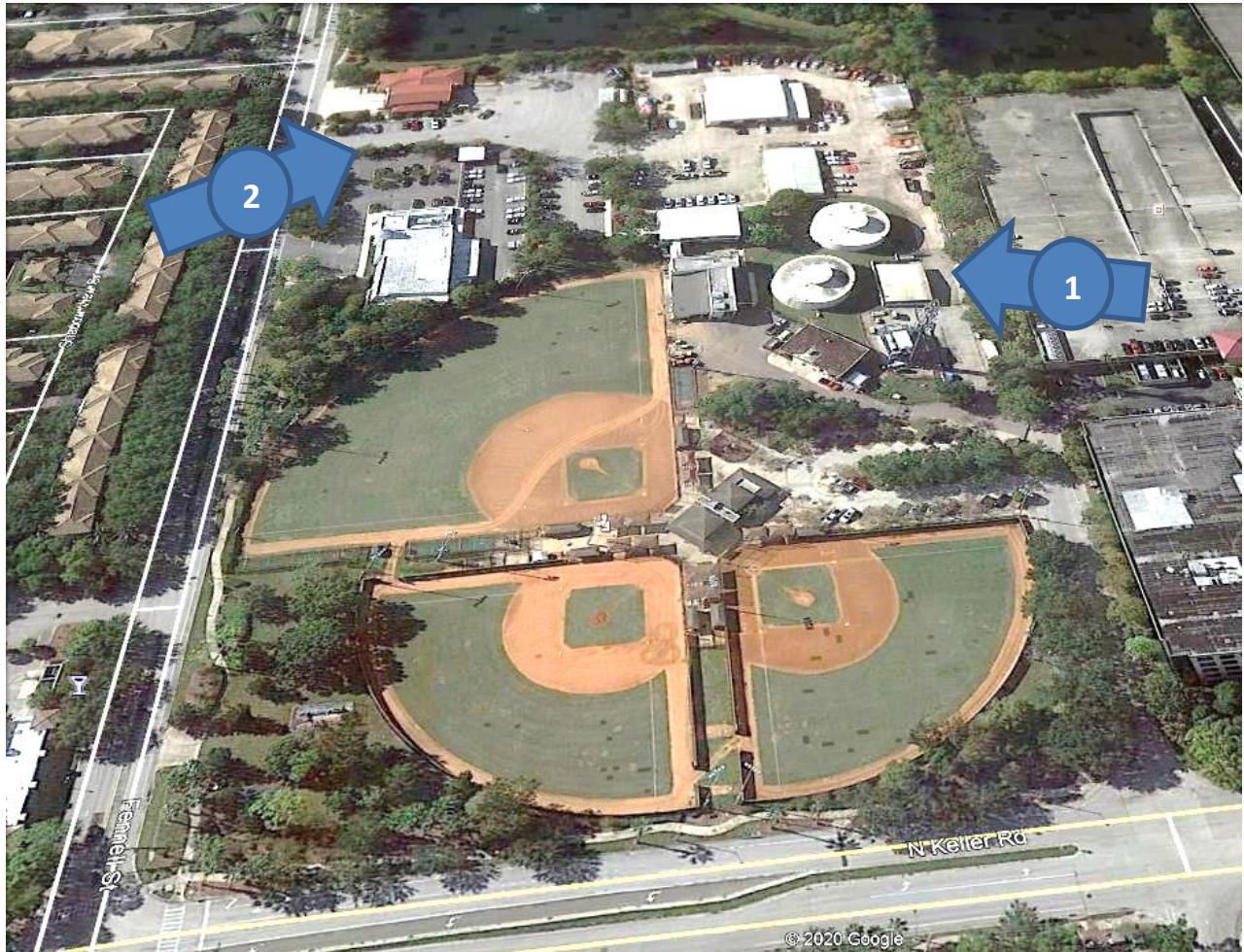
First Station #47 at the top left [1]; public works water plant top right [2] plus ball fields and a concession building.

The City of Maitland married two ideas in 1990: they had surplus land at the Keller Road Public Works site, home to their water plant [2] and Fire Station #47 [1]; and they needed a little league field for residents. The result of their co-location thinking was The Maitland Ballfield Complex. It has two 200' baseball fields, one 300' field, restrooms and a concession stand. This is the primary home site for Maitland Little League.