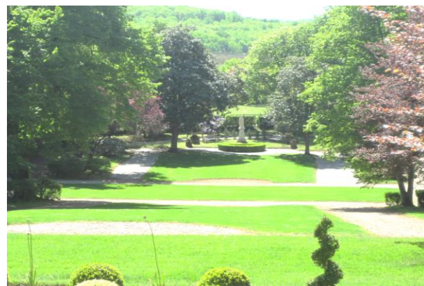
A quieter place.

Design and site every building to reinforce the park-like setting of main street. Place them, design them and use them as connected features that let the green spaces define the downtown.