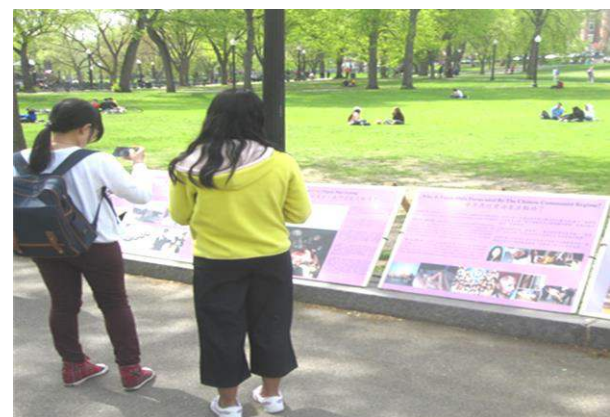
City parks as classrooms.