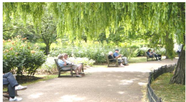
All the benches are full.