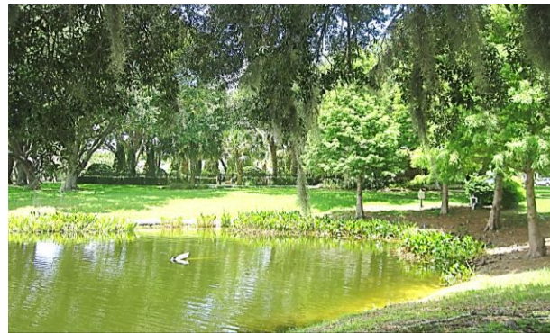
A neighborhood retention pond; and an amenity.

Designing the downtown with the same care and attention given to a highly visible, highly active public park requires the same balance of aesthetics and function.