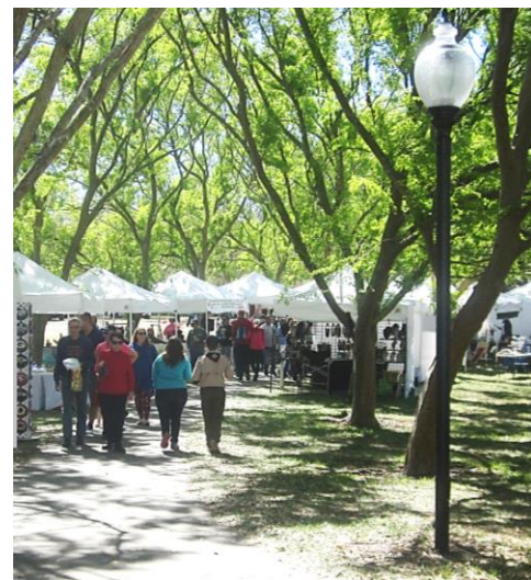
The fun of neighborhood festivals.