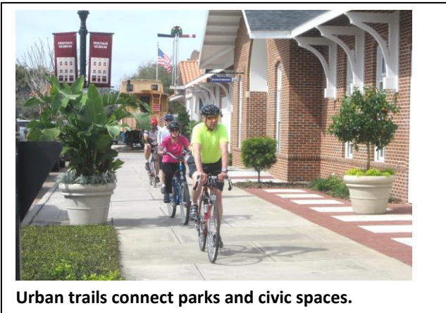
Urban trails connect parks and civic spaces.

Trails can use utility easements, drainageways and street corridors with sufficient space for safe pedestrian and bike travel. Using established corridor lands enables the trail system to be extensive without having to buy new property. "Rails-to-trails" is a model that can be applied to many other types of linear corridors.