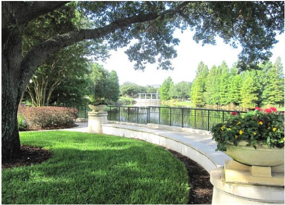
Urban stormwater as a park-side pond.

Creating places and spaces for happy memories in an important city function.