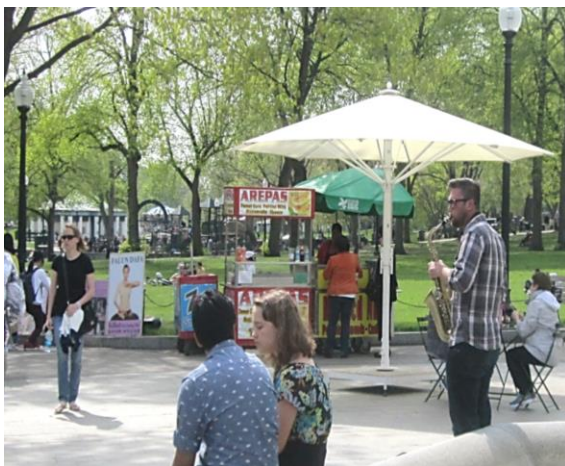
A concert in the park teaches the value of culture.