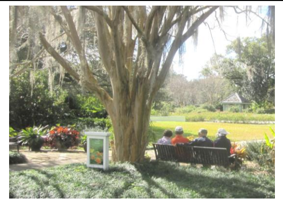
Public urban gardens.