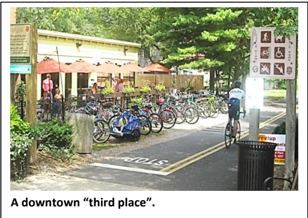
A downtown "third place".