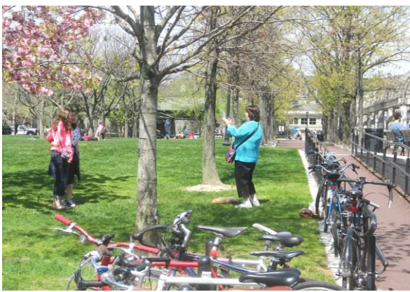
Public urban gardens and bikes.