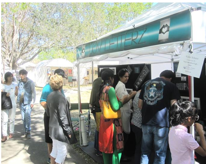
Saturday in the park.

Really “complete streets” provide for all modes of travel and of life. They are streets, trails, parks and spaces that beautifully and walkably connect homes, parks, shops, offices and schools.