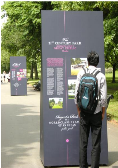
City parks are great classrooms.