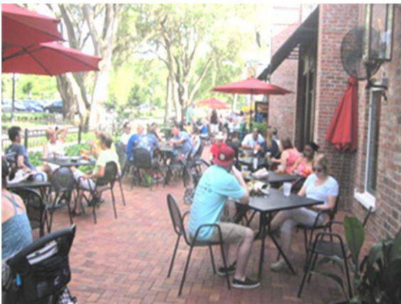
Lunch and business and pleasure, all in a park.