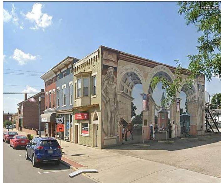
Public art; a testament to community values.