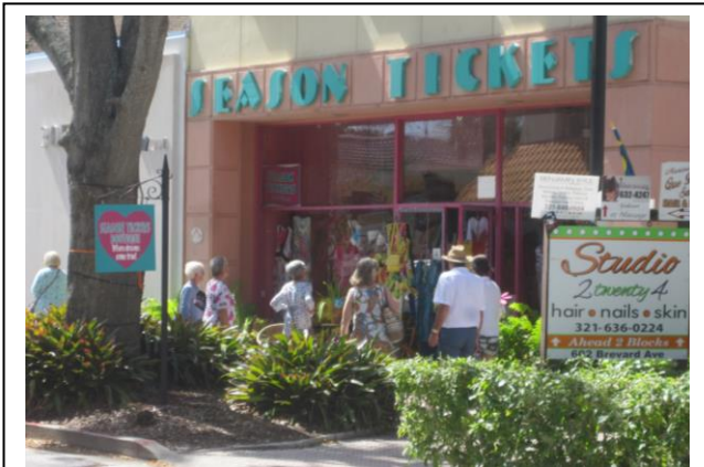
Box office in main street storefront, Cocoa Village FL.

Theaters are entertainment venues and architectural structures that are culturally relevant. Theaters are tenants, sometimes pro bono, sometimes not. Theater ticket windows can fill unused storefronts and be in the public library or other non-traditional locations.