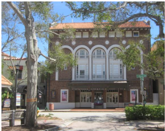
Cocoa Village FL downtown on main street.