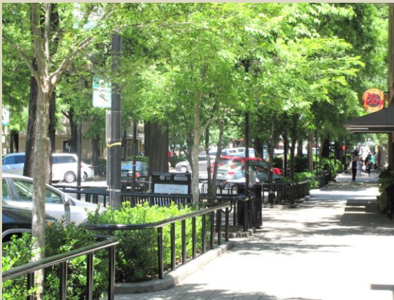
E. Main Street, downtown.