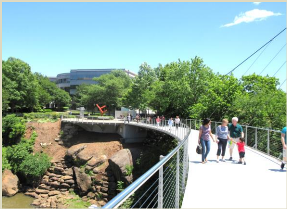
The Falls Park bridge over the Reedy River on the southside of E. Main Street.

CHARACTER. Greenville is an interesting, pleasant and prosperous City renowned for its economic success.