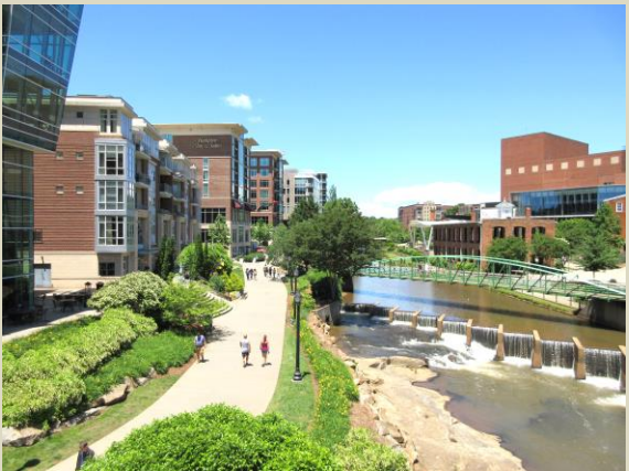
The Falls Park bridge over the Reedy River, new hotels and offices.