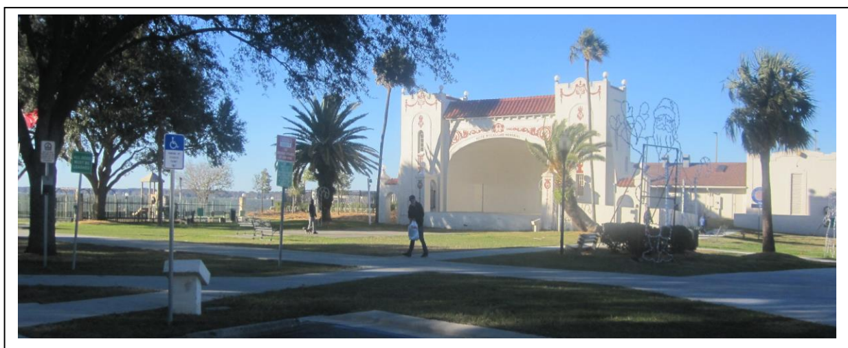
Eustis FL Downtown Lakefront Park and Amphitheater at the "foot" of main street.