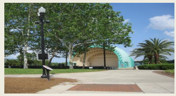
Lake Eola Park, Orlando FL.

Large and Professional. Big amphitheaters are serious business. Expensive and hard to site, they require professional management for large concerts, productions and many revenue producing events. With capacities for 5,000 or greater, they need a specific staff and program to justify the cost of professional management and technology.