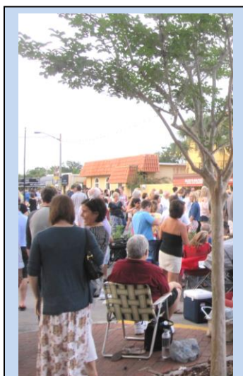
An annual street party draws families.

Community leaders set the stage, create the momentum and authenticate the events that become traditions. Local events, once established become part of community life. Volunteers appear every year. Visitors from out of town make an annual trek to enjoy traditional festivals or exhibitions. Businesses participate to show commitment to the town. New residents find participation as a way to become part of the community.