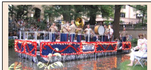
San Antonio's Fiesta.