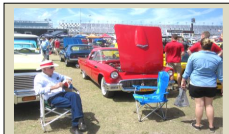
The annual Daytona Turkey Run fills the Speedway infield.