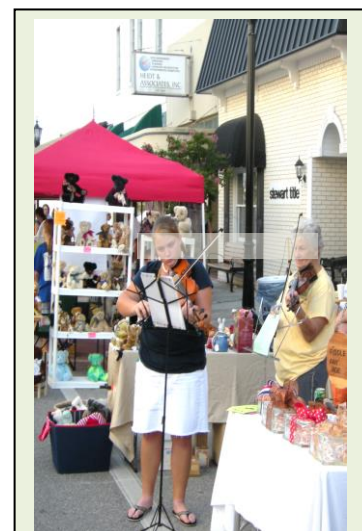
An annual downtown festival with local music.