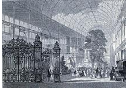
The Great Front Door of the Hall; Paxton's; Crystal Palace enclosed full grown trees in Hyde Park.

THE GREAT EXHIBITION OF THE WORKS OF INDUSTRY OF ALL NATIONS or The Great Exhibition (sometimes referred to as the Crystal Palace Exhibition in reference to the temporary structure in which it was held), an international exhibition , took place in Hyde Park , London, from 1 May to 15 October 1851. It was the first in a series of World's Fairs , exhibitions of culture and industry that became popular in the 19th century. Famous people of the time attended, including Charles Darwin , Karl Marx , Samuel Colt and the writers Charlotte Brontë , Charles Dickens , Lewis Carroll , George Eliot , Alfred Tennyson and William Makepeace Thackeray .