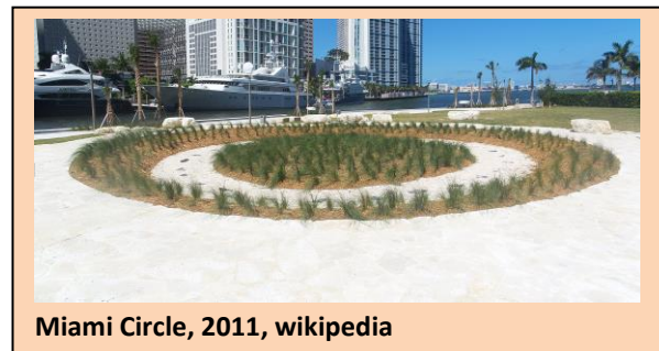
Miami Circle, 2011, wikipedia

LINK: https://en.wikipedia.org/wiki/Miami_Circle