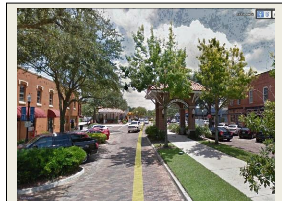
W. Plant Street in the 1990's, the difference is more than color.