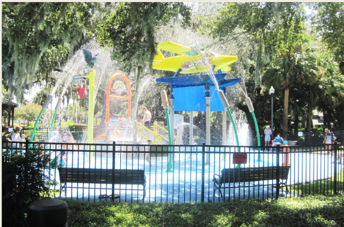
The seaplane theme is everywhere.