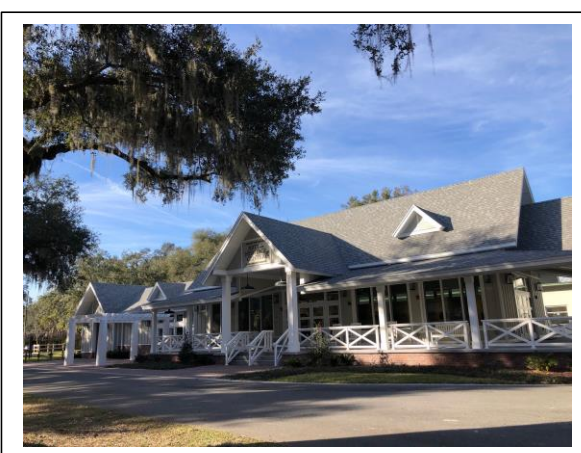
The Healthy West Orange Arts and Heritage Center at the Town of Oakland is now open Fridays from 11 a.m. – 3 p.m.

The Healthy West Orange Arts and Heritage Center at the Town of Oakland, located at 126 Petris Ave., is committed to preserving Oakland's past, present and future. The Center gives visitors the opportunity to see the Town of Oakland like never before as they step into a gallery full of paintings, historical photos, artifacts and more – all featuring Oakland as its centerpiece.