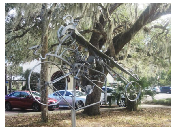
West Orange Trailhead, downtown Oakland.