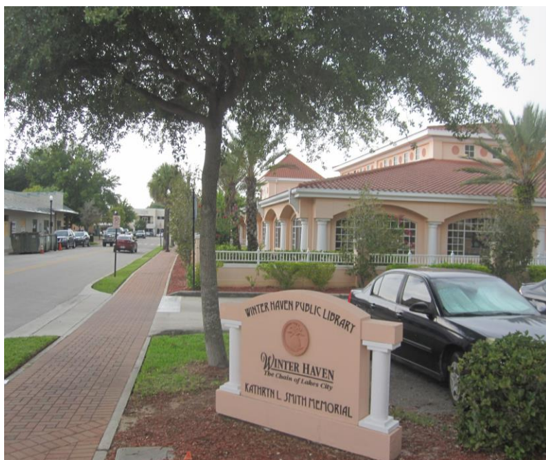
Winter Haven's downtown library.

http://whpl.mywinterhaven.com/services.html