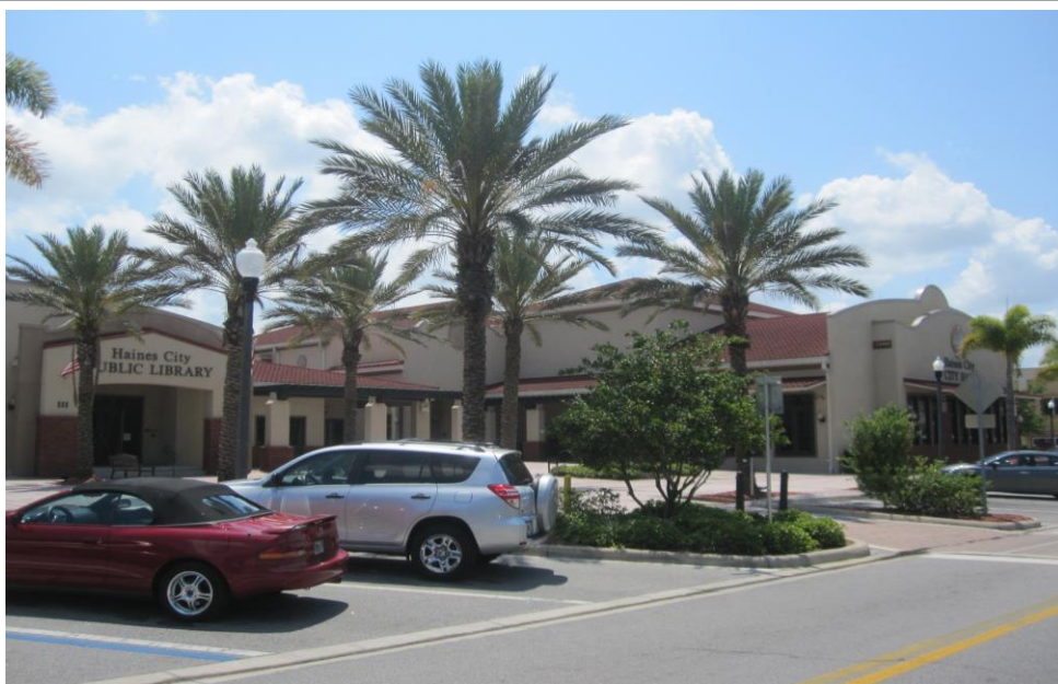
Haines City's downtown library next to City Hall across from the main street park.