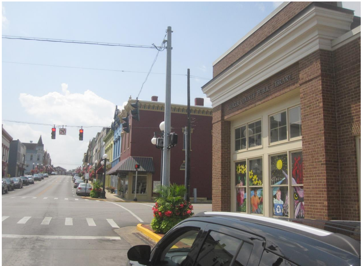
Harrodsburg's downtown library at "main and main".