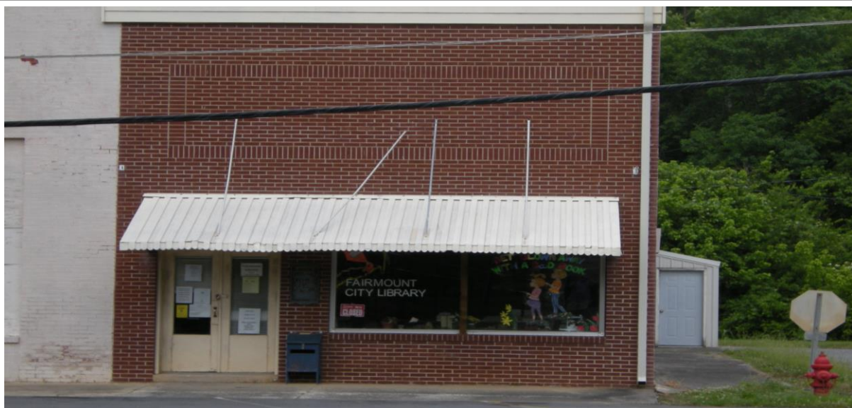
The most rural village center finds a place for the library.

PUBLIC LIBRARIES WELL USED, PARTNERED, PROGRAMMED AND LOCATED ARE GREAT COMMUNITY AND ECONOMIC DEVELOPMENT ASSETS.