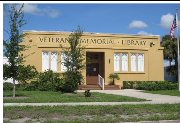
St. Cloud FL downtown.