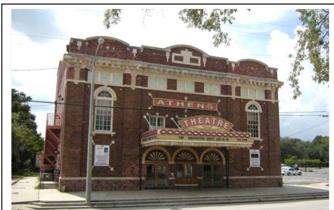
DeLand FL downtown.

Theaters are Centers for the Arts. Theaters, used properly, provide access to the arts for all, not just contributing patrons. Theaters provide opportunities for education with classes to encourage art appreciation and participation.