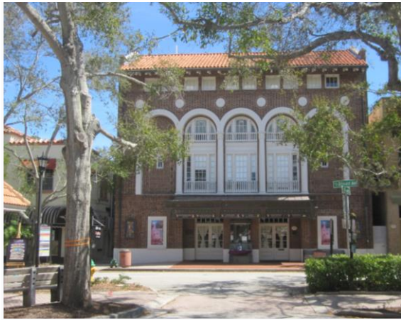
Cocoa Village FL downtown on main street.