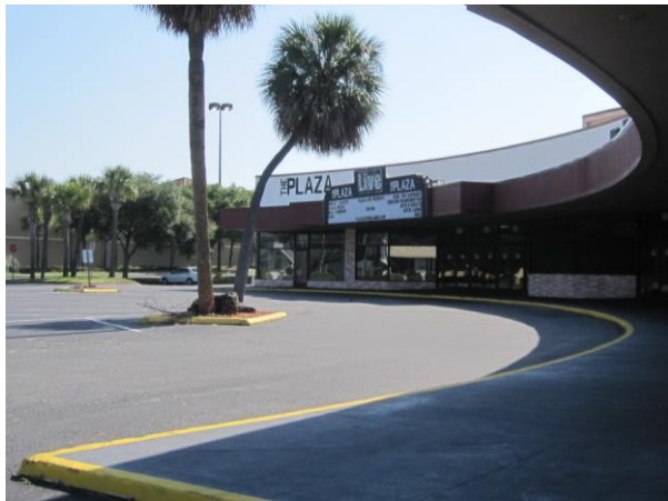
Orlando FL retail center w/retrofit theater: Plaza Live.

Theater design is important. The design of theaters as public buildings is important; there are a couple of choices. Like public libraries and local museums, community theaters come in a wide variety of shapes, styles and sizes.