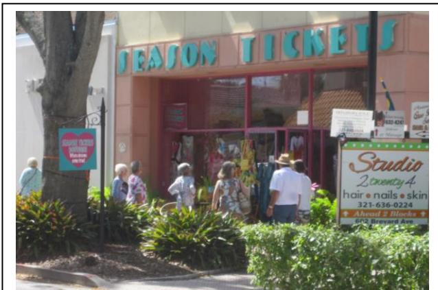
Box office in main street storefront, Cocoa Village FL.

Theaters are entertainment venues and architectural structures that are culturally relevant. Theaters are tenants, sometimes pro bono, sometimes not. Theater ticket windows can fill unused storefronts and be in the public library or other non-traditional locations.