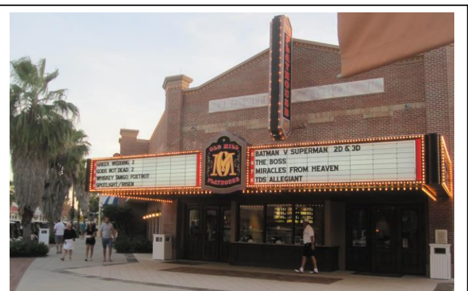
"Main and main" in a new town center.

In addition, most civic venues are under-utilized. Providing free or bargain prices to fill unused seats and spaces offers access to families who may not otherwise partake. It fills seats, sells popcorn and enhances the quality of life for everyone. Free rides and free access for non-peak cultural events is worth considering.