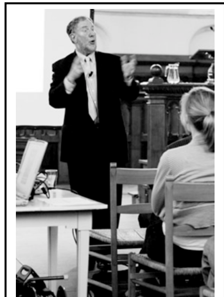
Robert D. Putnam (2006)

Summary Implications YouTube Published Reviews